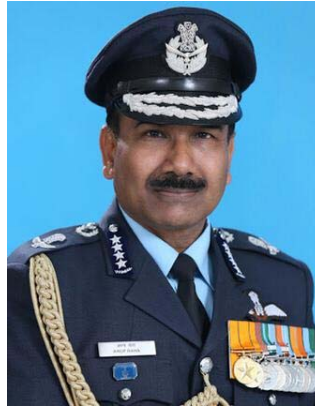
Air Chief Marshal (Retd.) Arup Raha

Air Chief Marshal Arup Raha retired as the Chief of Air Staff and the Chairman, Chiefs of Staff Committee on 31 December 2016. He graduated from National Defence Academy, Pune in 1973 and was commissioned into the Indian Air Force as a combat pilot. He has to his credit nearly 3500 hours of flying mostly on fighter aircraft.